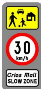
Sign F 403: 30 km/h Slow Zone

A more comprehensive sign than the 'Children Crossing' sign is the '30kph Slow Zone' sign. There are '30kph Slow Zone' signs located at the junctions of Donore Avenue with South Circular Road and Donore Avenue with Cork Street. This sign indicates to motorists that they are entering a residential area, and it applies to all roads within that area. It informs the motorists to be vigilant of children playing and that the speed limit is 30kph.